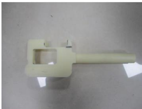
Handmade Inspecting tool