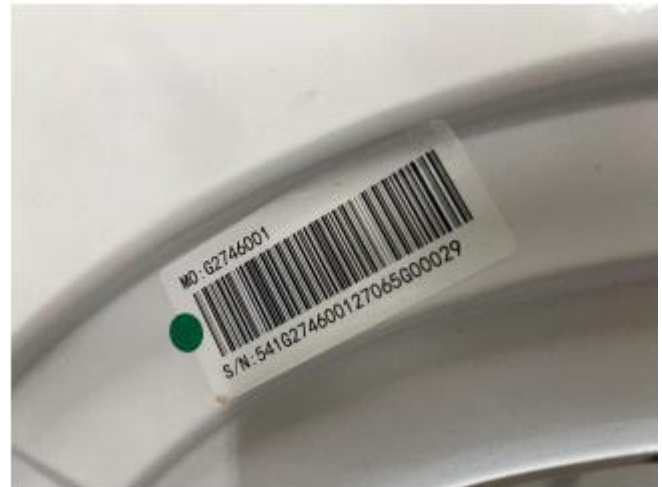
Green sticker showing check is performed on this unit.